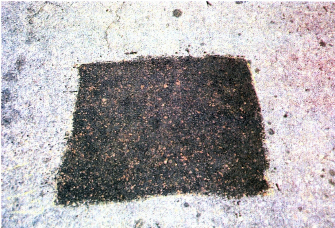
FIGURE 47-2 A: Total Penetration